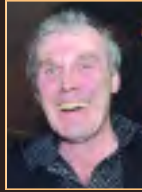
Liverpool Pubs Are Special

"To really get to the beating heart of Liverpool you have to visit its pubs. There you will find what defines its identity, its history and most of its people."